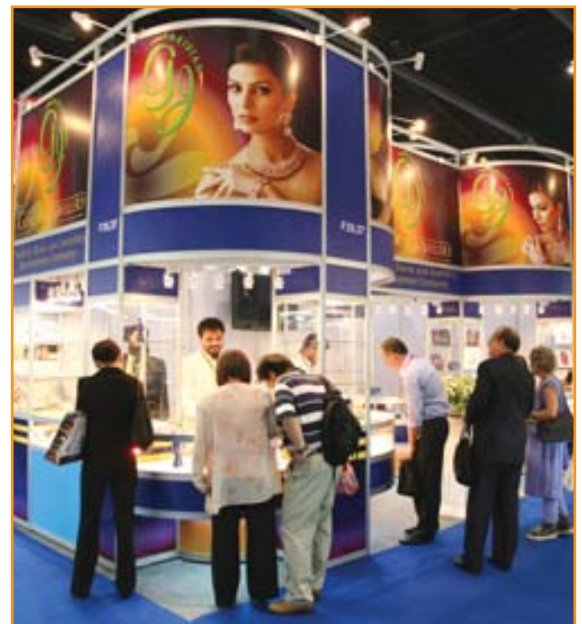
PGJDC Pavillion at Bangkok Gems & Jewelry Fair