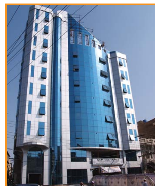
Gem Exchange - Peshawar

Gem Exchanges in Peshawar and Quetta are also home to the famous Gem Bazaars, which are organized on regular basis to provide a lucrative platform to the buyers and sellers of gemstones and mineral specimen. So far, PGJDC has successfully organized ten Gem Bazaars at Gem Exchange Peshawar, five Gem Bazaars at Gem Exchange Quetta and one in Lahore.