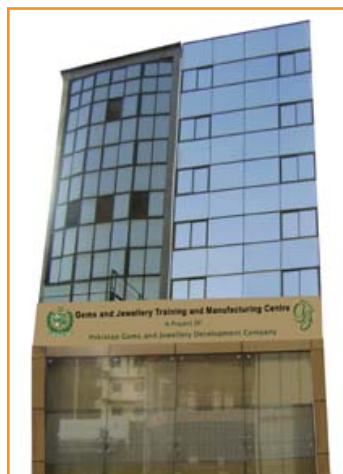
Training Center - Karachi